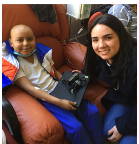
Through Fundación Mark, Lexmark Mexico donated computers to playrooms in children's hospitals, allowing children to play and learn while receiving chemotherapy.

Lexmark Mexico donated milk and milk powder to the <u>Monte Halac Foundation</u> for children who are victims of abuse.